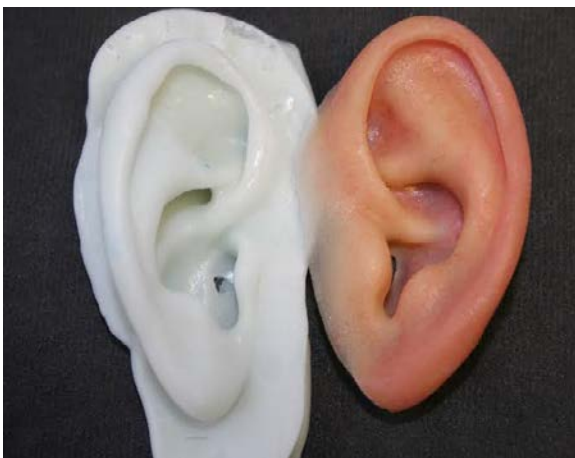
Anatomical model of the ear