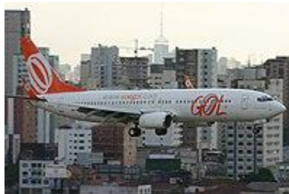
Figure 5 Gol flight landing at CGH.

In 1985, due to international flights ever-increasing restrictions, all the CGH's international flights were transferred to the Guarulhos International Airport (GRU), due to the new technology and safety requirements for international flights operation.