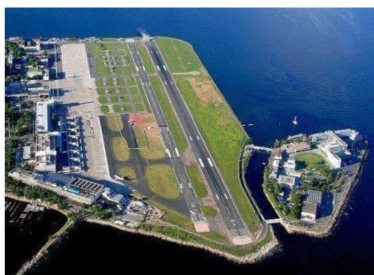
Figure 3: SDU Airport.

Observe in Figure 2 that Tom Jobim International airport in Rio de Janeiro (GIG) has the longest runways in Brazil. Observe also that CGH and SDU (Santos Dumont Airport, in Rio de Janeiro), both have the shortest runways out of the N=10 busiest airports. Both represent the oldest civil airports in Brazil, built in places impossible to be expanded: CGH is surrounded by city constructions, buildings, in the heart of São Paulo downtown, while SDU was built in the middle of the Guanabara Bay, as illustrated in the Figures 3 and 4, respectively: