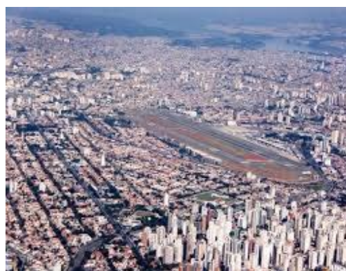
Figure 4: SDU Airport.