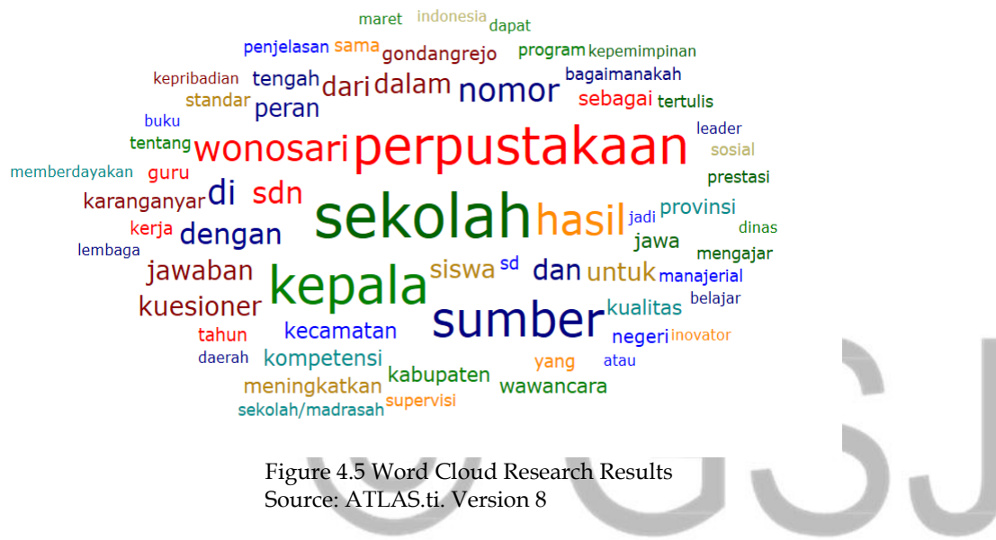
Figure 4.5 Word Cloud Research Results

The ATLAS.ti research method has its own way as a function of helping the data analysis process, such as organizing data properly, storing neatly the research data, making it easier for researchers to find the required data through code, finding out the relationship between research data, and others. For the results of research using the ATLAS software, version 8 is found in Figure 4.5. up to Figure 4.9. as follows.