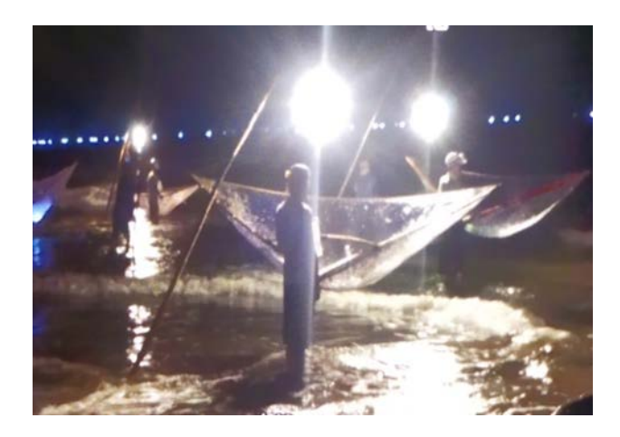
Figure 1. Fisherman Glass Eel in Coastal Waters Sukabumi

koja /seed container is full of glass eel, the fishermen will climb inland two to three times until the morning (Fig. 1).