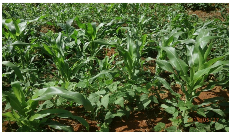
Figure 5: A Crop Farm Showing the Required Crop Density and Geometry for Intercropping Maize, Beans and Irish Potatoes on a Single Ridge

Optimum plant density is necessary to obtain maximum yields. Crop fields with high crop densities in the study area from observation did not produce healthy crops. Maize, for example, did not show healthy ears in such fields as opposed to low density crop fields. Figure 5 shows a farm with a good crop density and geometry in the vicinity of Ndu Town.