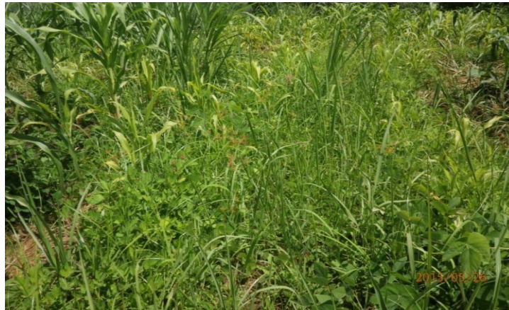
Figure 6: A Weed Infested Farm in The Mbaw Plains Ndu Sub Division (Notice Yellowish Nature of Maize Leaves and Groundnut Leaves)

variations. Without interference by man, weeds would easily wipe out the crop plants (Harpals et al., 1984). This is so because of their competition for nutrients, moisture, light and space which are the principal factors on which crop survival is based. Generally, an increase in one kilogram of weed growth will decrease one kilogram of crop growth (Roundy, 1996). Figure 6 displays a farm infested by weeds in Mbaw Plains. This shows that the weeds have absorbed all the nutrients and the crops are left with nothing. Weeds germinate earlier and their seedlings grow faster. They also flower earlier and mature ahead of the crop they infest.