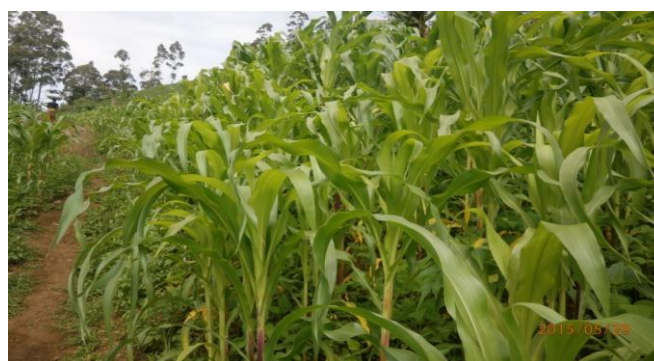
Figure 4: Crop density and geometry of maize, beans, potatoes, soya beans, Chinese cabbage and a pumpkin farm in Kakar. (Field work, 2015)

On the contrary, when the density is more than required, individual plants get narrow space leading to competition for growth factors between plants resulting in a reduction of yield per plant. The yield per plant decreases gradually as plant density per unit area is increased as shown in Figure 4