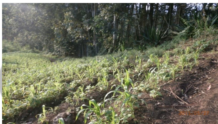
Figure 3: Farm land shaded by trees from sunlight. Note the stunted nature of the crops due to nutrient deficiency

The yield of a crop depends on the final plant density. The establishment of required plant density is essential for getting a maximum yield. For example, when a crop is raised on stored soil moisture under rain-fed conditions, a high density will deplete moisture before crop maturity. On the other hand, a low density will leave moisture unutilized. Hence, optimum density will lead to effective utilization of soil moisture, nutrients and sunlight amongst others. When soil moisture and nutrients are not limited, higher density is necessary to utilize other growth factors (solar radiation) efficiency. Figure 3 presents a farm with crop field with the required density and geometry but which did not receive sufficient sunlight. Notice the unhealthy appearance of the crops as a result of the shade of sunlight from the trees adjacent to the farm plot. The maize plants grew very thin with the leaves becoming yellowish showing deficiency in nutrients. From field evidence, the bean plants in this part of the farm were affected by the dwarf virus and all the bean plants appear stunted with their leaves twisted.