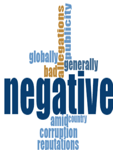
Figure 1.1: 'Employee' word count

The public sector employees, however, had their own grievances. Some of them outlined that they had never received proper induction when they joined their respective departments. Moreover, they highlighted several factors as affecting their performance and the reputation of their respective institutions. These are illustrated by word cloud in Fig 1.1.