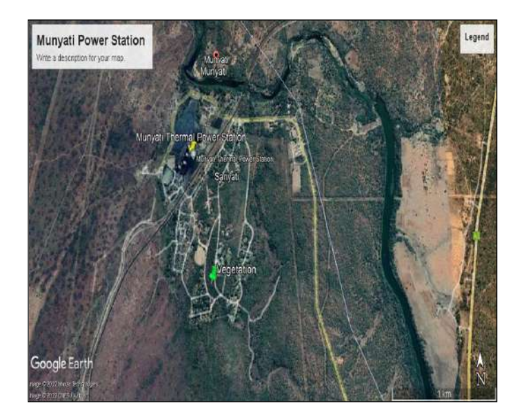
Figure 2. An aerial google earth image of the MPS.

The data were collected from the Human-Wildlife Conflict cases reports spanning a period between 2019 and 2021 (Jan-Dec). These data consists of approximately 25 reported cases of Hu man-Wildlife Conflict at MPS. The data were collated with the Human-Wildlife Conflict cases reported to the Parks and wildlife Authority Problem Animal Control (PAC) and the Kwekwe Parks central region office. The data were then consolidated for the purposes of coming up with a short communication on the Baboon-Human Conflict crisis that is posed by Baboons ( Papio cynocephalus ) at MPS. Zimbabwe Power Company (ZPC) runs two schools in Munyati, a primary and secondary school. The schools have a total enrolment of 1025 pupils and do not only serve ZPC employees' children but also those living in the surrounding communities as well [65][66].