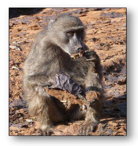
Figure 3. A female Chacma baboon ( Papio ursinus ).

Baboons are large semi terrestrial monkeys that occupy a wide range of habitats across the African continent [4][31][33]. Plants are their most important source of nutrients, with invertebrate and vertebrate animals contributing relatively little in terms of calories and protein to their diet [1].