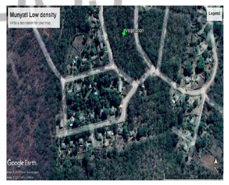
Figure 5. An aerial view of low density housing area at MPS

There is an interesting observation on the Baboon-Human con flict cases reported at MPS, the low-density areas have the least number of households and have bigger yards where they can grow bigger orchards of fruit trees, gardens and set up other small backyard projects [64](Figure 5). The same wards comprise the wealthy residents with affluent lifestyles which mean that they may be having more organic waste which may attract baboons to those areas.