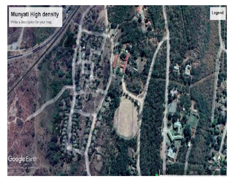
Figure 4. An aerial view of a high density area at MPS.

Extensive research has been undertaken on Papio species in savanna habitats, and they have been shown to be ecologically flexible omnivores which are highly selective in their dietary choice and habitat ustilisation [7][29][4][26][62]. The Chacma baboons in Zimbabwe are expected to exhibit significant selection or preference to certain habitats as an adaptation to times of scarcity within their home range. Food availability is highly variable in savanna habitats or biomes, hence food availability acts as an ecological constraint on the baboons, prompting them to compensate with different foraging strategies [4][8]. Temporal variations in food availability in an animal's habitat may force it to modify its home range size as a behavioural adaptation [37][7]. The study of an animal's home range enables an understanding of the distribution and utilisation of resources in time and space [18][21] and is expected to correspond to the distribution of resources that the animals need to use.