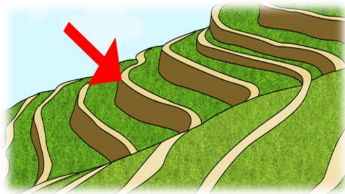
Varied levels on a hillside for good use of space

aren't easily accessible. Consider planting shrubs that cluster near walkways so that their greenery will disguise the need for edging.