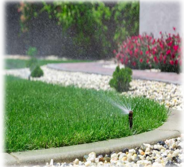
Effective spray heads.