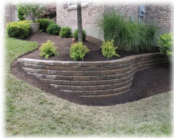
A typical retaining wall on a slopy landscape.