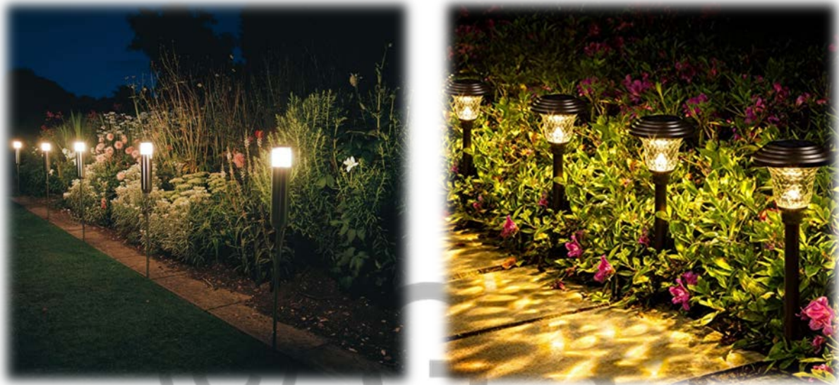
Interesting landscape lighting ideas

Solution: Landscape lighting allows you to extend the enjoyment of your resort experience. Plants and outdoor living environments take on a new dimension at night when lit creatively. And, today's innovative landscape lighting technology allows you to switch the light color as a fun way to accent areas of your building or landscape during holidays or special events.