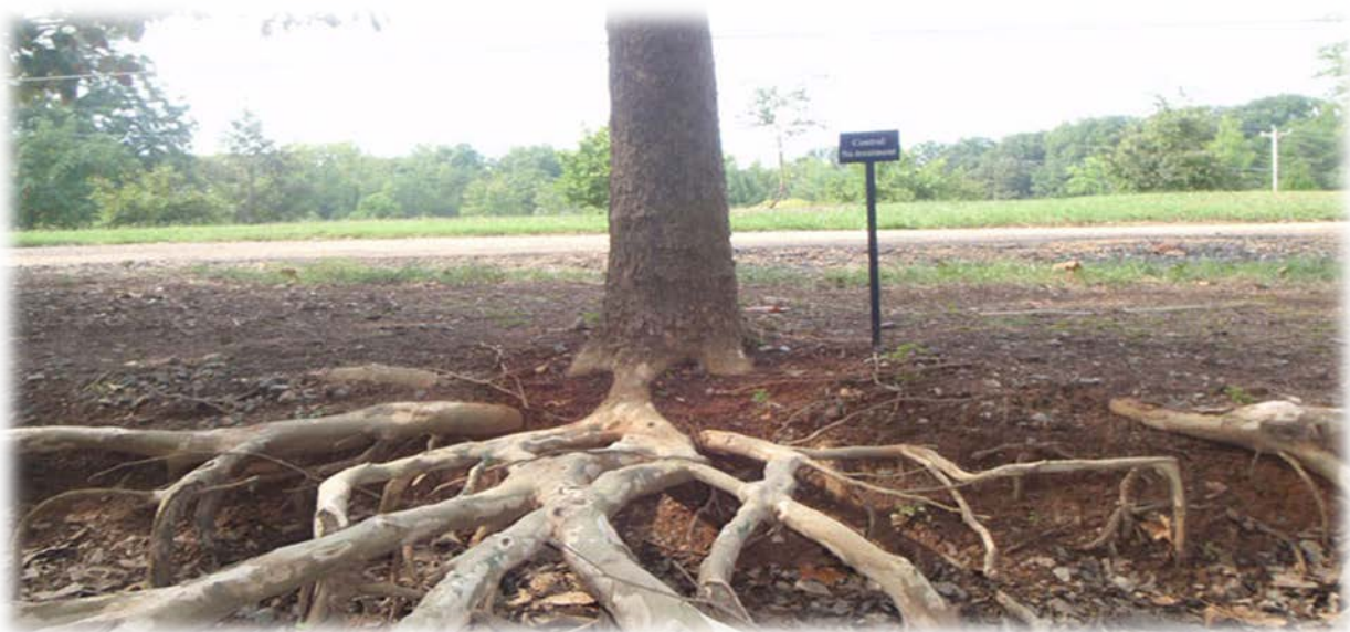
Exposed tree roots that can cause accidents

This is another pedestrian obstacle. As trees mature, roots that are close to the surface can be exposed and appear to erupt out of the ground. Sometimes, roots create slight bumps in the lawn; and other times the roots protrude and can become a trip hazard for guests on the resort property.