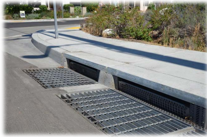
Effective catch basins

solution: During a property walk-through, identify areas where water run-off and puddling or flooding is a concern. From there, proper drainage infrastructure such as catch basins can be incorporated; raised planting areas to redirect water can be employed as well. Also, there are hardscape options such as permeable pavers that can absorb water run-off more readily.