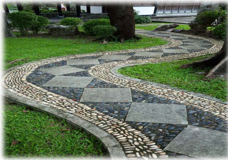
Typical pavers that can adjust slightly to ground movements