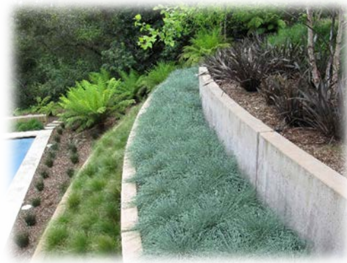
Reinforced concrete Retaining walls