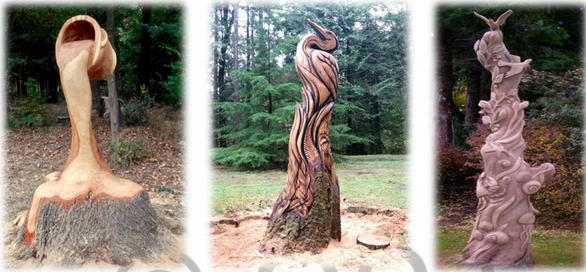
Carvings on aging tree trunks to enhance the environment until it withers away

Solution: Plant smaller trees nearby, and make an event of it. If the time comes when you need to remove the aging trees, consider leaving the trunk and carving it to enhance beauty until it withers away. Older trees can leave a legacy that adds character to resort properties—and meanwhile, the new trees will fill in.