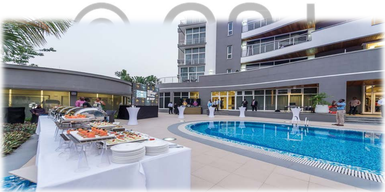
Excellent pool side from The George Lagos , 30 Lugard Avenue, Ikoyi, Lagos.

Solution: Refresh poolside landscaping by consulting with an experienced landscape provider.