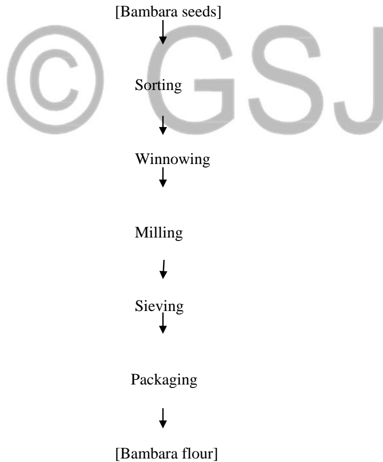
Figure 2: Bambara Flour Production