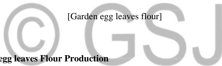
Figure 3: Garden egg leaves Flour Production

Production of Biscuit: Using technique as described by Ohizua et al. (2017), the biscuit sample was made by combining Bambara groundnut, rice flour, and African eggplant leaf.