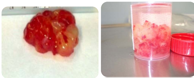
Figure 2: Myxoma after removal. It was huge

Anatomo-pathological result was in favor of myxoma , as shown in Figure 2