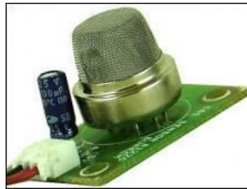
Fig.2: MQ-9 Gas Sensor

MQ-9 Sensor unit: The most common gas leakage at homes/industries are carbon monoxide and liquefied petroleum gas (flammable gases), MQ-9 gas sensor as shown in fig.2. is deployed to detect any gas leakages and report to the control unit of the system.