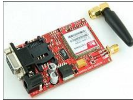
Fig.3: Sim900 GSM Modem