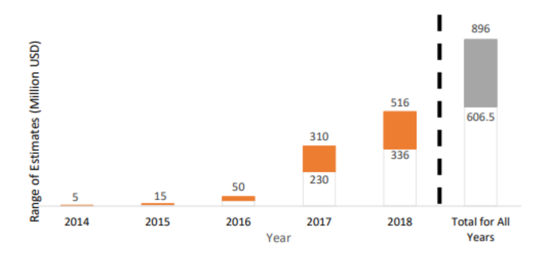
Figure 2: Estimate of Total Funding of Chinese Commercial Space Companies

Our best count of investment in the commercial space sector is between about $600–900 million in the years 2014–2018, with most of those investments made in the last 2 years (Figure 2). Most interviewees believe that VC will shrink in the coming years, or at least be concentrated in a smaller number of companies and sub-sectors.