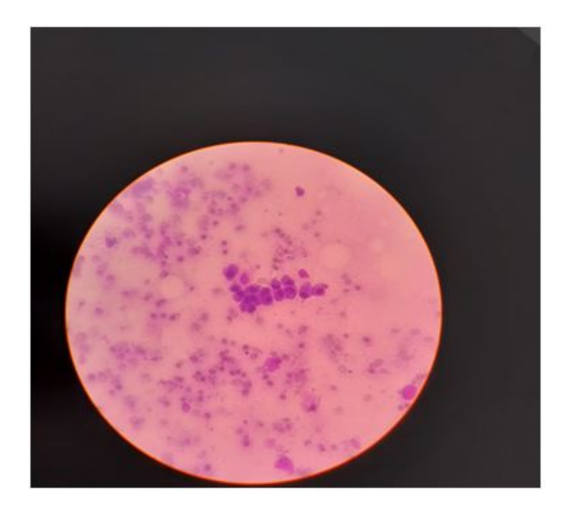
MICROSCOPY FINDINGS: Normal hepatocytes.