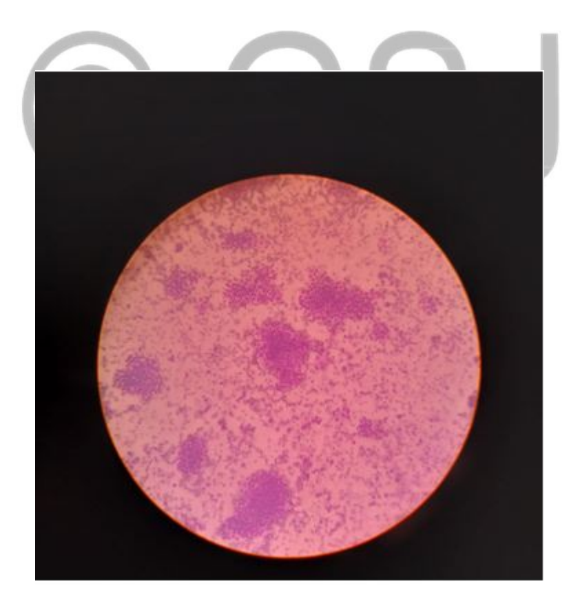
Low power: Cluster of malignant cells.