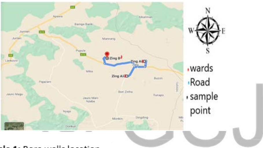
Table 1: Bore wells location

Zing lies between longitude 10^{0} and 11^{0} E and latitude 9^{0} and 10^{0} N of the equator with land area of 1,030km<sup>2</sup> and estimated population of about 127,363 ([22]. The area falls within the transitional belt of savanna in North eastern Nigeria. It has a temperature range of 25^{0} C to 33^{0} C in both rainy and dry seasons with good climatic conditions for agricultural activities. The study area is endowed with a lot of natural resources such as mountains, natural grasslands, rocks, peasant and commercial farmers, shallow streams and good weather conditions for habitation. The study area (see Figure 1) covered three wards in Zing metropolis which are Zing A1, Zing A2, and Zing B.