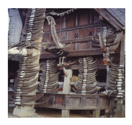
Figure 10. Pictures of Kabongo 'and Katik on the Tongkonan Ne'Dorre