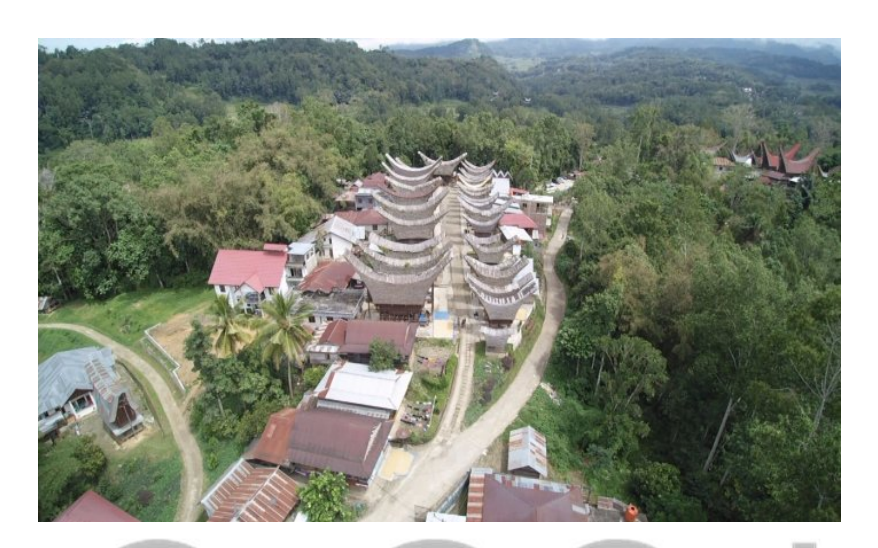
Figure 3.Site Plan three-dimensional Palawa custom village 'Source: Yultin Rante (2017).

The pattern or basic form of Palawa 'traditional village, reflecting the original village pattern, extending from east to west with tongkonan and alang facing each other and forming pangrampak (space) between the row of alang and tongkonan is also part of the built environment of Tongkonan, which has an important role in during traditional ceremonies. Even though the oldest house is usually at the end of the sunset, but in this traditional village, Tongkonan Buntu as the oldest tongkonan, is in the second position from the end of the sunset, so that is specific to this traditional village. Palawa traditional village patterns', can be seen in Figure 3 below.