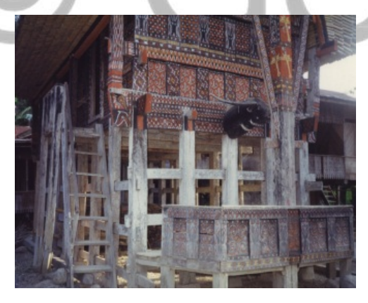
Figure 8. Structure of a traditional house pole in Palawa '

The structure and construction of tongkonan in Palawa 'is the same as the shape and structure of other tongkonan in Toraja, except for the curve of the longa which looks higher. Likewise, the existing structural materials, consisting of foundation stones, hardwood structures, bamboo roofs, and ropes from rattan and fibers. The construction sections that are rather specific to the tongkonans in this traditional village are not prominent. The number of lentongs (poles) in front of the house, generally five, namely: two lentong garopang (corner poles) and three lentong alla '(center pillars). The poles are connected by roroan kondik (short tendrils) that stretch from east to west, which is usually at the upper end of the middle lentong kabongo '(buffalo head decoration) attached. In front of the row of pillars is a kind of terrace as a transition before going up to the house called Tangdo '(figure 8).