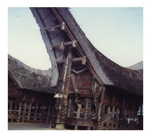
Figure 7. The shape of Tongkonan Ne' Dorre