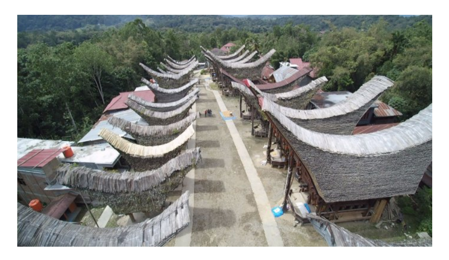
Figure 4. Palawa Customary Village Pattern '

The pattern of Palawa 'customary village', following the pattern of opposites, is the Tongkonan with the front-facing each other, and among them creates a positive space called the Impact or the Impact as a very important space for the implementation of customary rituals. To show the pattern of the village can be seen in figure 4. Below.