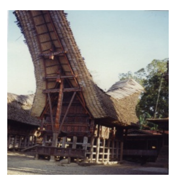
Figure 6. The current shape of Tongkonan Buntu

After hundreds of years of age and the initial shape is broken, then Tongkonan is usually renovated or rebuilt in the same place. If there are still structural materials that can be used, mainly pillars and wall materials, then it will still be used. But if everything is rotten, then the structure material may be replaced with a new one, but certain parts must be maintained as a sign that the house is old. After being renovated, the current shape of the tongkonan Buntu can be seen in Figure 6 below.