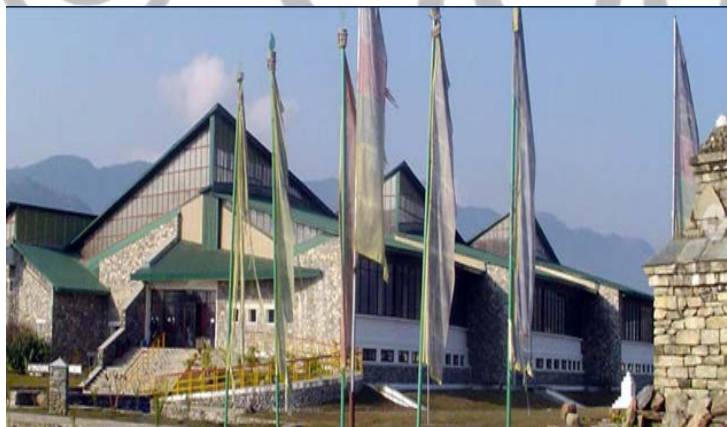
Figure 1: A photo of IMM

The International Mountain Museum abbreviated as IMM is a biggest museum located in Pokhara, Nepal. As a name this museum has a number of collections on information and artifacts related to mountain such as famous mountains of Nepal as well as world, mountain people of Nepal and mountain activities. More information on IMM can be seen from the site http://www.internationalmountainmuseum.org .