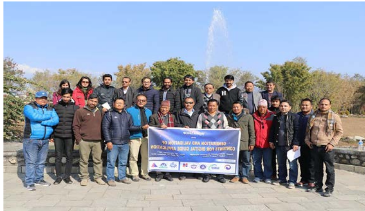
Figure 3: A photo from organized workshop

This workshop provides the information about the project, IMM with its artifacts, guidelines for collecting and generating information. Further, categorized the artifacts and built the teams with responsibility of collecting and generating artifact information, containing professional writers, museum staff, consultancy staff, and experts of the related field on the basis of the group of artifacts.