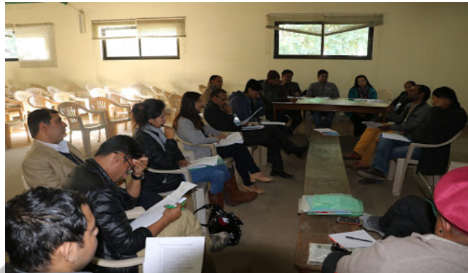
Figure 5: A photo of content generation team on duty