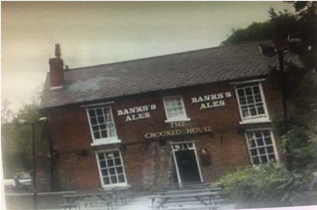
Figure (2) A low-rise building with a landing

It is clear from the previous figure that the slope and subsidence appears with the naked eye, as a result of the subsidence of the soil on which the building rests. [14]