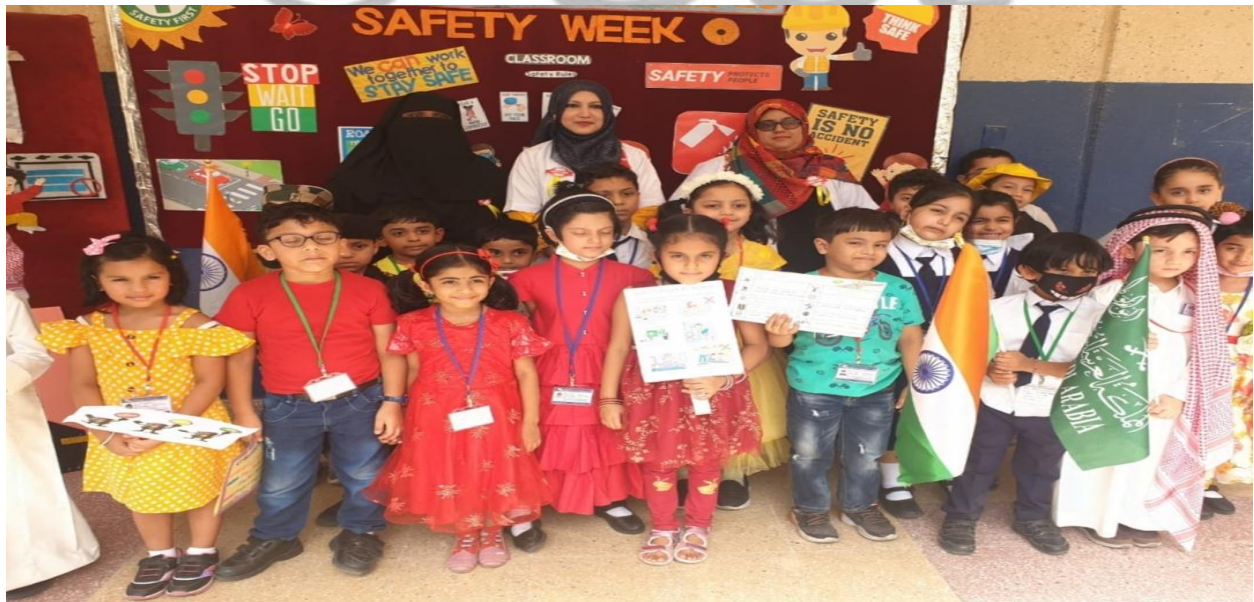
Safety week assembly students with their teacher, CCA INCHARGE & JPS SUPERVISOR