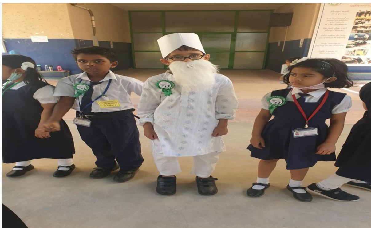
Class 2 student dressed up as RABINDRA NATH TAGORE

We selected best 4 students from each class (37 sections comprising 17 sections of class 1 & 20 sections of class2)