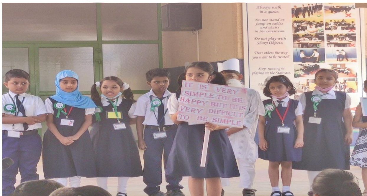
Quotes of R.N. Tagore were delivered by the student of Class 2