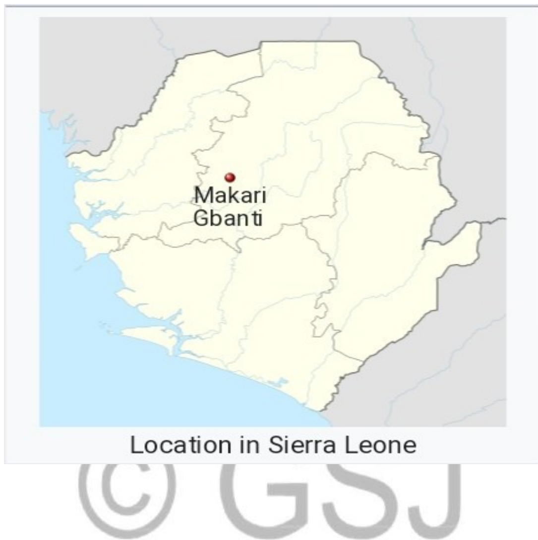
Figure 2: MAP SHOWING MAKARIE CHIEFDOM