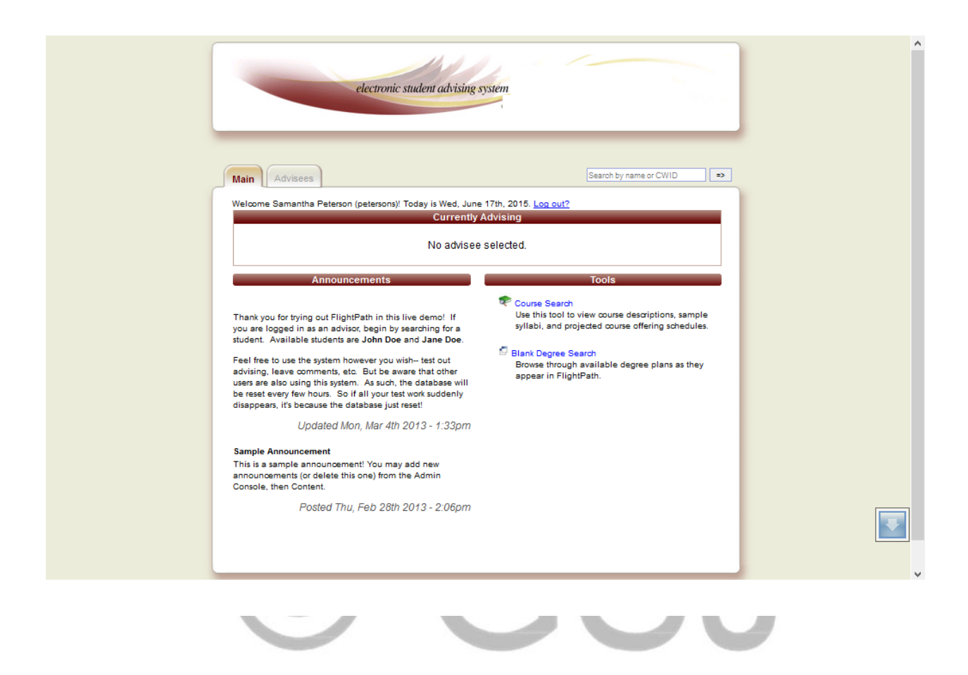
Figure 2: Adviser's Screen