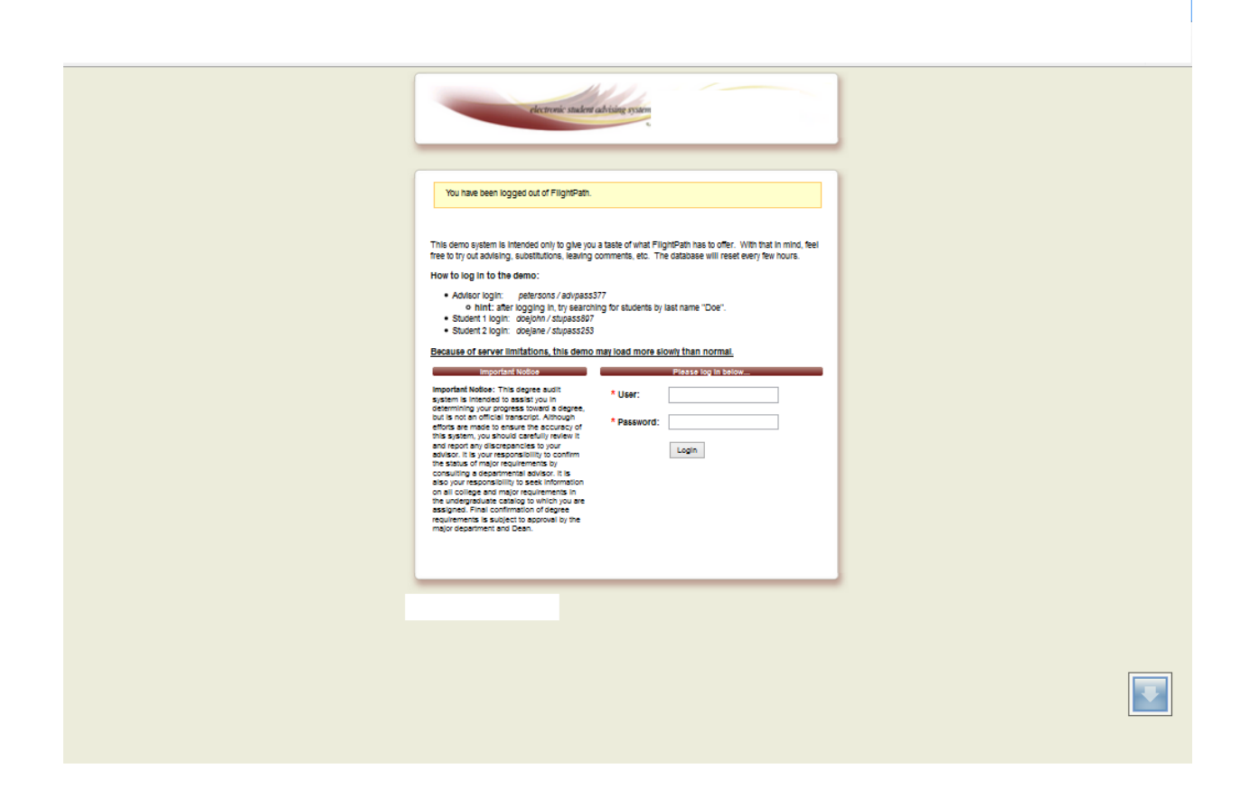
Figure 1: Login Screen