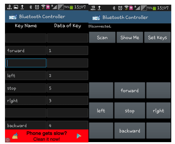
Figure 3. After setting keys press ok.

When we touch forward button in Bluetooth controller app then car start moving in forward direction and moving continues forward until next command comes. When we touch backward button in Bluetooth controller app then car start moving in reverse direction and moving continues reverse until next command comes. When we touch left button in Bluetooth controller app then car start moving in left direction and moving continues left until next command comes. In this condition front side motor turns front side wheels in left direction and rear motor runs in forward direction. When we touch right button in Bluetooth controller app then car start moving in right direction and moving continues right until next command comes. In this condition front side motor turns front side wheels in right direction and rear motor runs in forward direction. And by touching stop button we can stop the car.