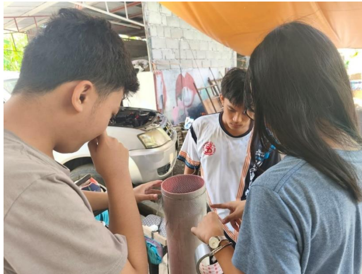
Image 13. Assembling PVC tube