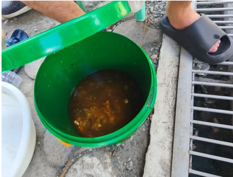
Image 2. Industrial Wastewater collected from Davao City

Samples of wastewater were collected from the canals and drainage systems around the main areas of the food processing industries in Davao City, including those near the Anflo Industrial Estate in Panabo City, the Food Processing Innovation Center area, and the Calinan and Agdao districts. These are strategic places to source samples of typical industrial wastewater contaminated with FOG, since various food manufacturing and processing companies are within these places. Collected samples were stored in appropriate containers, and transportation was carried out under controlled conditions.