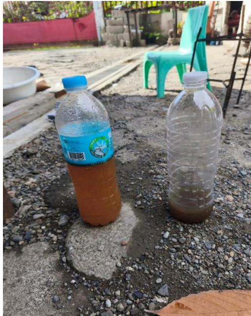
Figure 1. Before and after photos of industrial wastewater samples treated with banana-peel biochar filtration tube prototype.

The treatment performance of the banana-peel biochar filtration tube was assessed through visual and sensory inspection of industrial wastewater samples before and after filtration, as demonstrated in Figure 1.