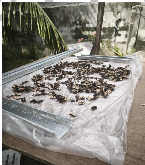
Image 8. Sliced Unripe ( Musa acuminata ) cavendish banana peels that was left to dry for 5 days