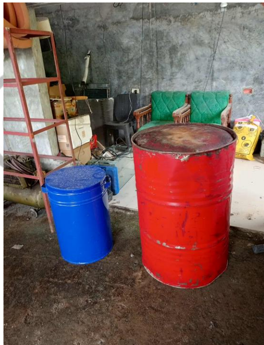
Image 6. Barrels for Double-Barrel Retort System Pyrolysis