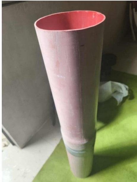
Image 5. PVC Tube used for filtration