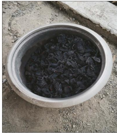
Image 11. Banana Peel Biochar