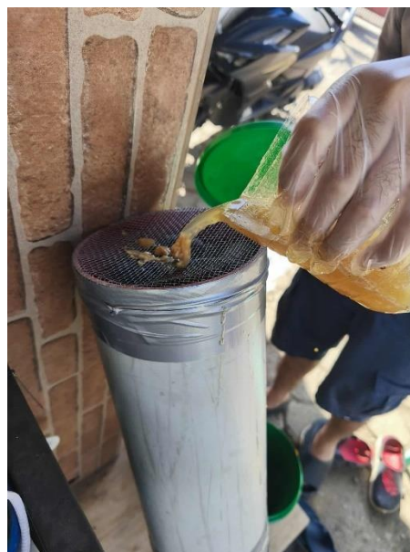
Image 13. Putting Industrial wastewater in the filtration tube

The filtration experiment was conducted once using the assembled prototype filtration column. A total of 250 milliliters, measured and equivalent to one-fourth of a 1000 milliliter mineral water bottle, was poured at the top of the column, with gravity driving the filtration process through the pebble layer, mesh, and biochar bed. The treated water was collected at the outlet for observation and analysis. This single trial served as a feasibility demonstration to assess the functional capability of the banana peel biochar filtration prototype.