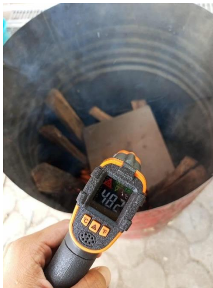
Image 10. Pyrolyzation of Banana Peel Biochar