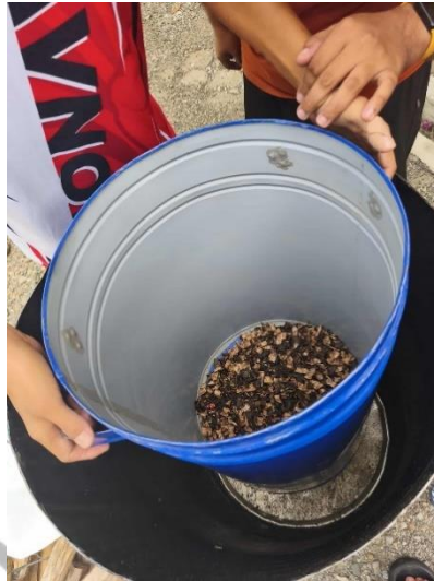
Image 9. Setting up Double Barrel Retort System

The biochar was produced through the process of slow pyrolysis of dried banana peels in a double barrel retort system. Dried peels, which were put inside the inner barrel, were heated with firewood put inside the outer barrel at a temperature of about 470° to 500°C, temperatures were monitored with a handheld infrared (non-contact) thermometer for three hours in an oxygen-limited environment. This controlled thermal decomposition promotes the breaking down of organic material into porous carbon-rich biochar with high surface area and adsorption capacity. The banana peel biochar, after pyrolysis, was allowed to cool before being collected, ground, and kept inside airtight containers for subsequent use in filtration experiments.