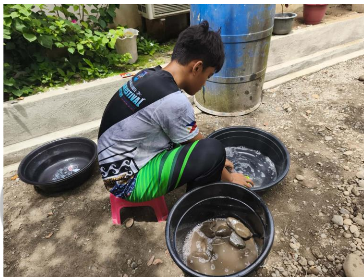
Image 4. Pebbles being washed thoroughly