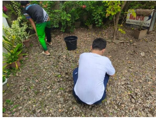
Image 3. Pebbles collected outside the researchers' homes