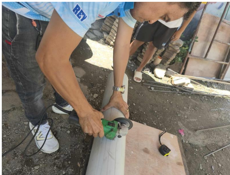
Image 12. Cutting PVC tube into segments

Filtration media are packed from the inlet, or top, of the column to the outlet, or bottom, in the following sequence: a pebble layer in the top segment serves as a coarse pre-filter and flow distributor. A mesh filter is placed below the pebbles to prevent the pebbles' migration into the bed of biochar. Banana peel biochar is densely packed into the bottom segment as the primary adsorbent material of this filter. This provides effective filtration because there is a high degree of contact between the wastewater and the biochar.