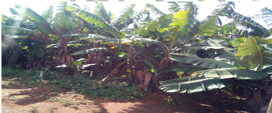
Banana plantation before COVID-19 lockdown

Contributions from focus groups on strategies which can be implemented were that the government and non-governmental organizations should help smallholder farmers by providing recommended protective equipment and sanitizers by medical experts, so that they can continue to produce and distribute produce to selling points. The government should relax the restriction on smallholder farmers' movement so that they are able to harvest and sell their produce. During lockdown, the government should assist with transport for smallholder farmers since public transport is prohibited during lockdown. Most farmers lost their crops which need irrigation such as bananas due to curfew imposed by the government in order to try and reduce the spread of the disease. Such crops which need frequent irrigation dried and it will take time to recover.