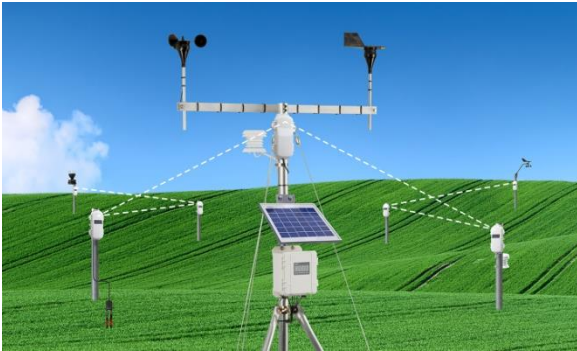
Fig 1 Track Field Outdoor Monitoring devices