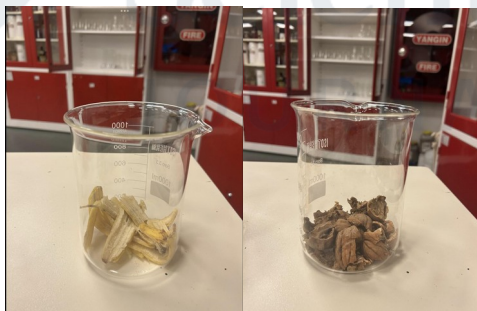
Fig. 1 and 2. Preparation of bioplastic film