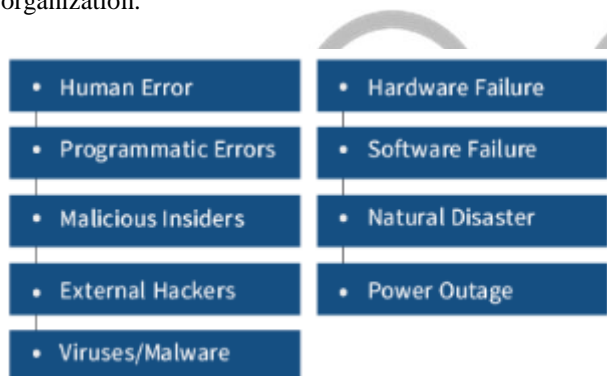
Figure 3 Major causes of data loss in cloud servers

For the protection of clients there ought to be our utilization security understanding between the cloud administration and client with the goal that everybody should realize that however is going on when a client is putting away its private records in the cloud servers. (Herhalt, 2012) At the point when any client sign in on visit cloud administration in the wake of entering their subtleties into the four there is an alternative of tapping on the client and friends understanding and it is the obligation of the client to peruse it appropriately with the goal that he should recognize what are the security laws of the distributed computing organization.