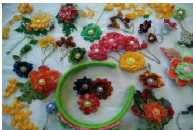
Figure 2 . Accessories from fish scales (source: Kusnadi et al. 2018)

with chlorine water and detergent for one hour, then rinsed thoroughly. The second stage is the coloring stage. The trick is to boil the clean fish scales with the desired textile dye for 5 minutes in boiling water. The third stage of the drying process, drying the fish scales in a place that is not too hot to avoid rolling the scales until they are completely dry for further assembly. The fourth stage is assembling the scales into a brooch according to the preferred shape, by attaching the flower-like scales to a flannel cloth that has been formed in the basic pattern and attaching it to a safety pin or stringing it on a necklace or bracelet chain.