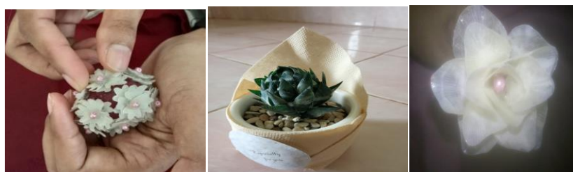
Figure 3 . Accessories from fish scales (key chains, fish scale cactus, fish scale roses)