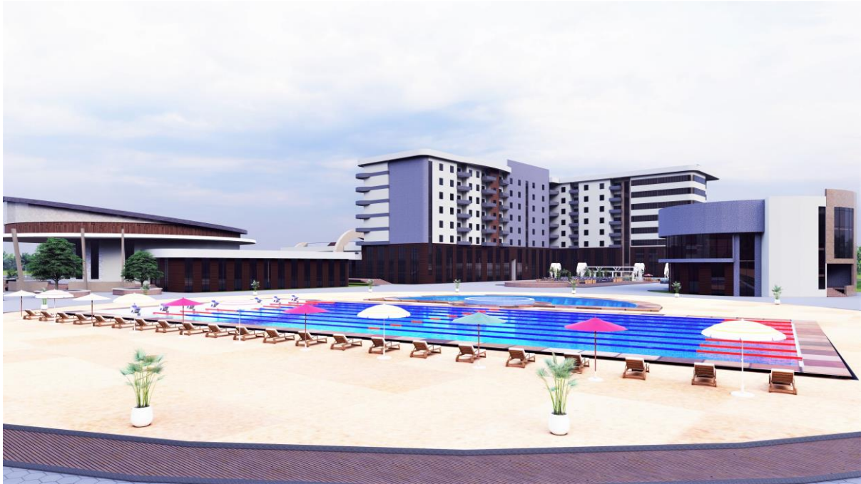
Plate 10. Perspective view 1