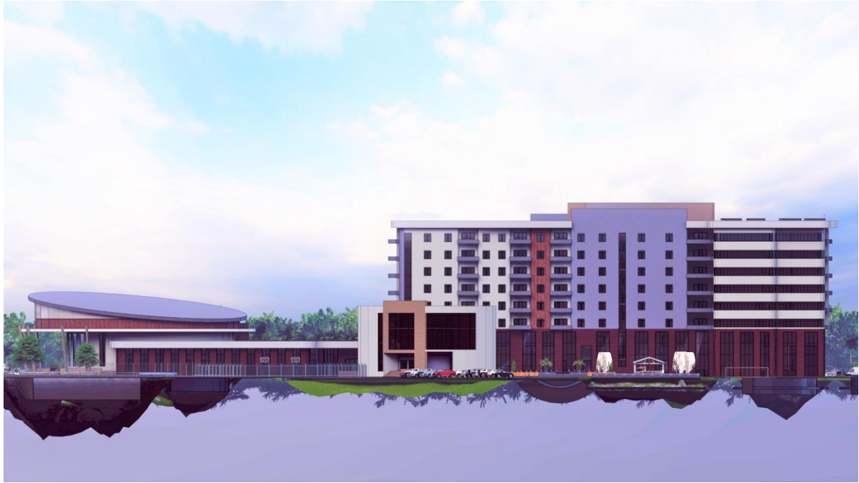
Plate 8. Rear elevation of the proposed building.