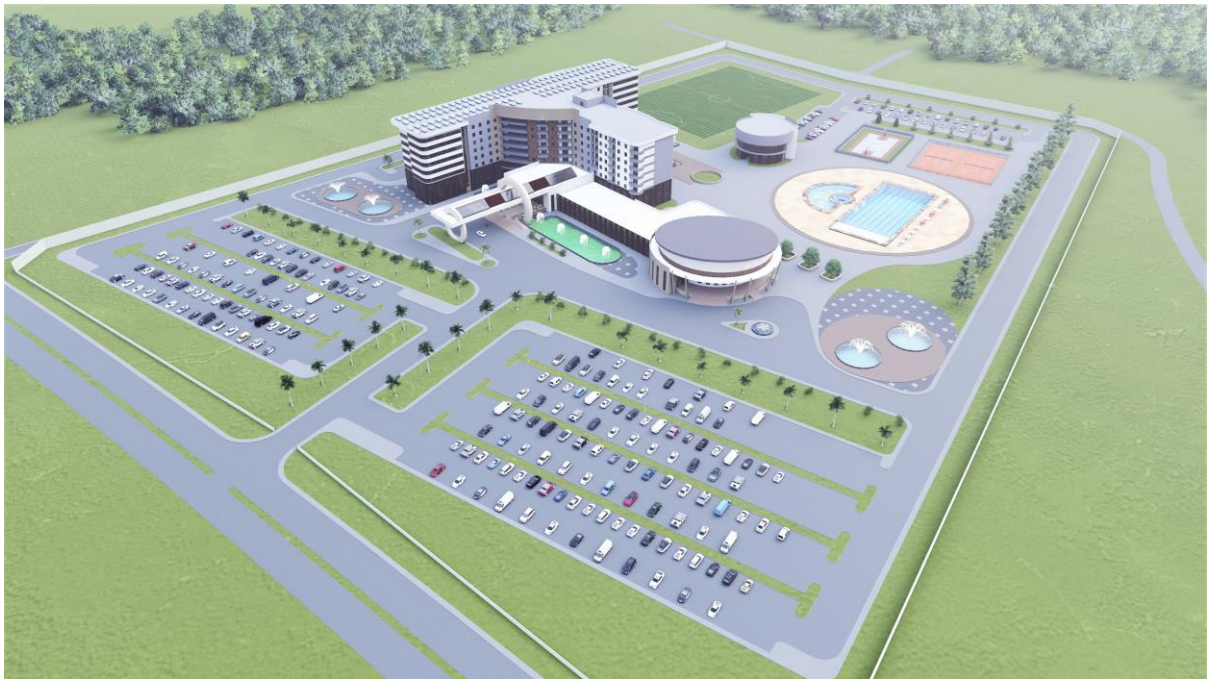
Plate 11. Perspective view 2