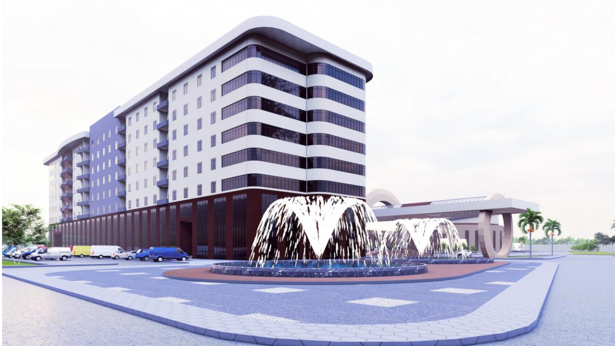
Plate 12. Perspective view 3