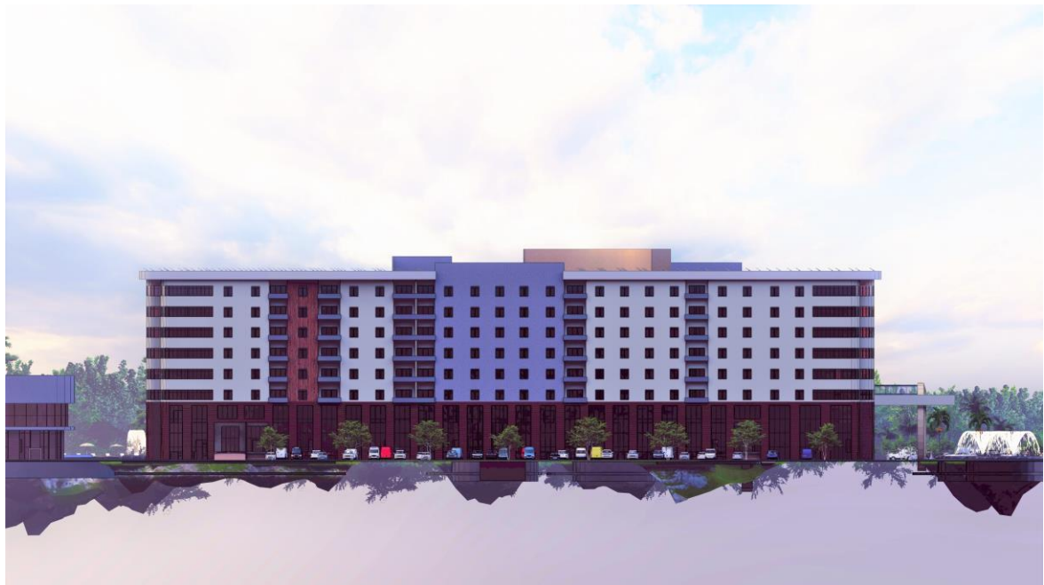
Plate 9. Left side elevation of the proposed building.