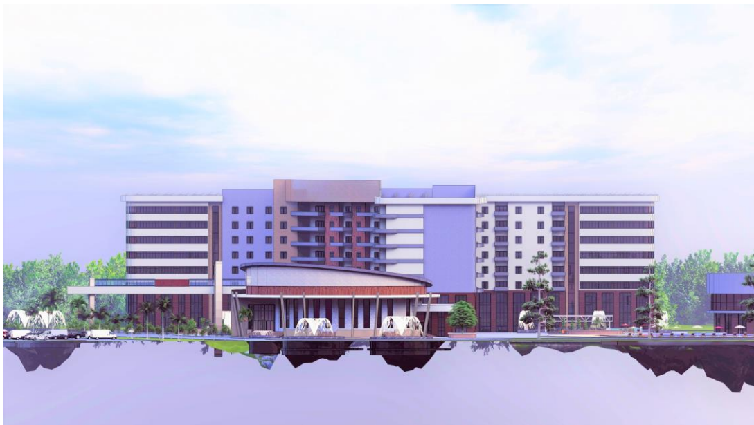
Plate 7. Right side elevation of the proposed building.