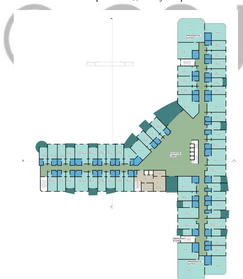
Plate 5. Proposed floor plan for the second to the sixth floor.