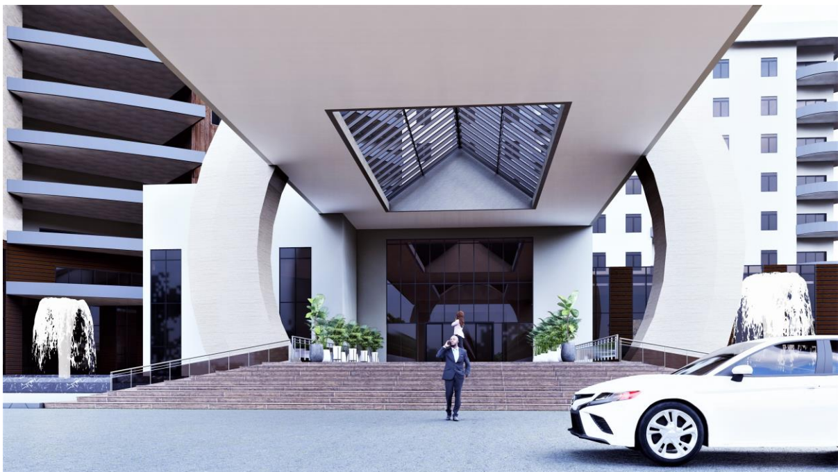
Plate 13. Perspective view 4