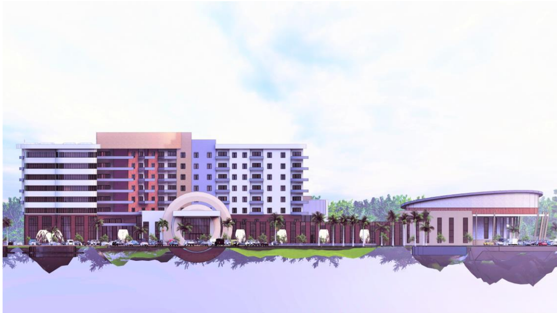
Plate 6. Approach and rear elevations of the proposed building.