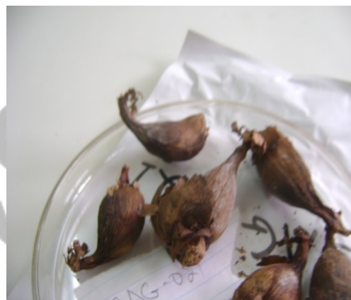
Figure B. Dry Plods of korrarima seeds before it is opened