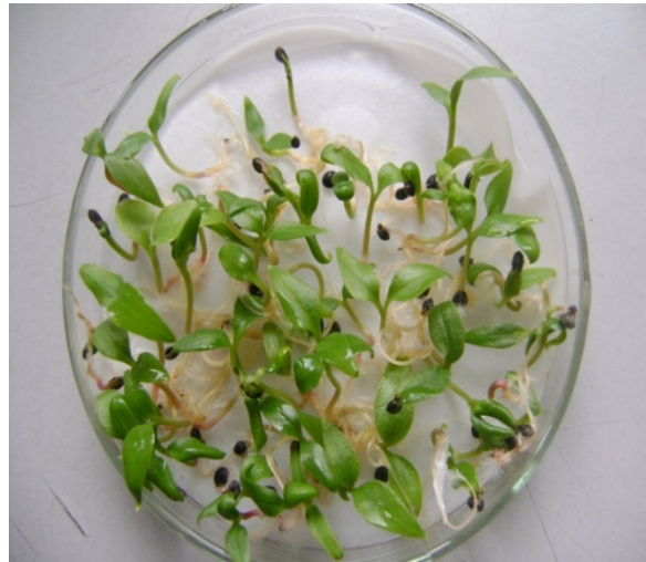
Figure E. 45 days , all seeds grow showing good performance.