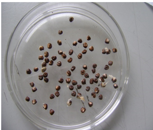
Figure A, Fresh & clean seeds korrarima.